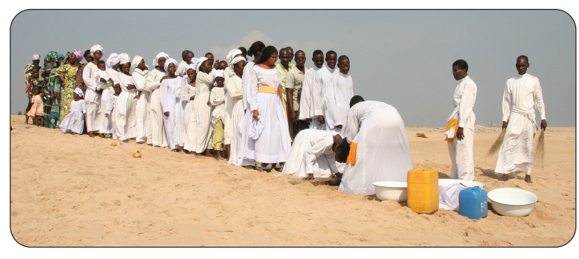
© "Benin - baptism ceremony in Cotonou" by Ferdinand Reus / CC BY 2.0

frican Initiated Churches (AICs) either broke off from, or developed independently of, mainline churches and denominations. They are a powerful and growing force in Africa. Out of 600 million African Christians in 2018, at least 100 million Africans are affiliated to AICs.