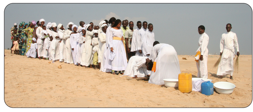
© "Benin - baptism ceremony in Cotonou" by Ferdinand Reus / CC BY 2.0

frican Initiated Churches (AICs) either broke off from, or developed independently of, mainline churches and denominations. They are a powerful and growing force in Africa. Out of 600 million African Christians in 2018, at least 100 million Africans are affiliated to AICs.